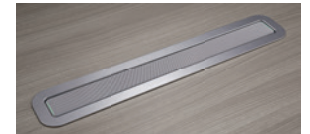
MXA710 Flush Mount