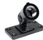
A710-MSA Mic Stand Adapter