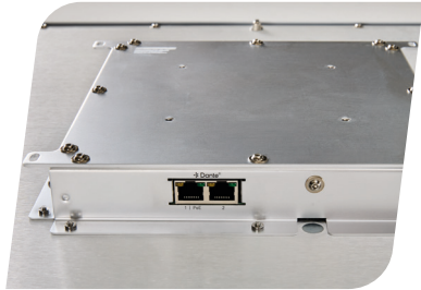
Dual RJ45 Network Ports