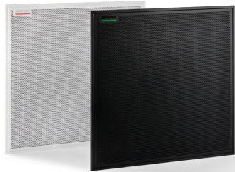
MXA925-60CM Ceiling Array Microphones Front